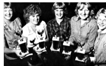
Group shots are sometimes unavoidable. Get the group close together and get everyone looking at the camera at once. Take several shots, because someone will undoubtedly blink when you snap the shutter.