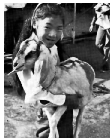
This photo would be better if the background were less distracting. This might have been done by waiting for people to walk out of the picture, finding another place, or using a wider f-stop to blur the background.