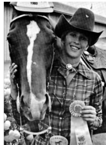
This photo brings all the essential story-telling elements together: the girl, her horse, and the ribbon they just won.

Media consent is obtained from volunteers and members at the time of enrollment. Before volunteer or members' names or pictures can be used in a report, consent must be obtained first. For various reasons people may not choose to have their name or picture used. We have to make sure we respect their wishes.